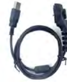
Programming Cable (USB Port) PC38