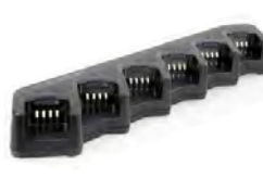
MCU Multi-Unit Charger (For Thick Battery) MCA08