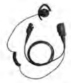
Earset Swivel EHN17