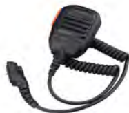
Remote Speaker Microphone (IP57) SM18N2