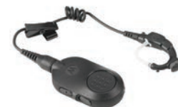
Operations Critical Wireless Earpiece

“When I first saw the MOTOTRBO SL Series I thought that it was a cell phone, not an actual two-way radio. It has all the capabilities of a two-way radio but with a professional, discreet look that fits absolutely well with all our uniforms.”